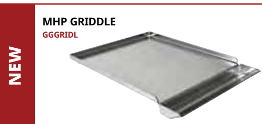
MHP GRIDDLE GGGRIDL

Available for all JNR, WNK & TJK model grills.