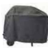
Full-Length Grill Cover CV2PREM