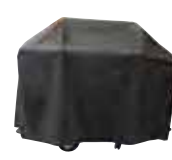
Full-Length Grill Cover CV4PREM