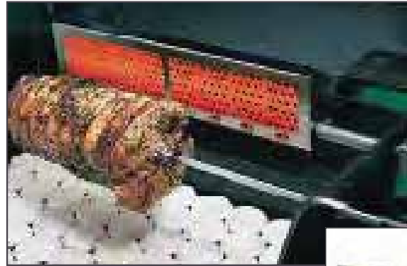
INFRA-ROAST® ROTISSERIE BURNER SYSTEM GGRRB3-N | GGRRB3-P

Available for all JNR, WNK & TJK model grills. Not recommended for post mount applications.