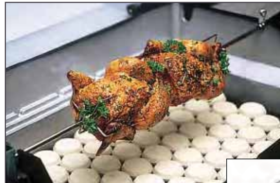
ROTISSERIE KIT RKMHP

Available for all JNR, WNK & TJK model grills.