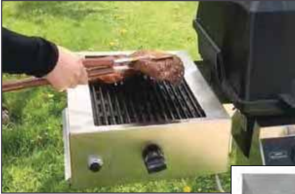
SEARMAGIC® INFRARED SIDE GRILL MHPSEAR-N | MHPSEAR-P

Premium accessories designed specifically for our mounted grill heads with quality materials and craftsmanship.