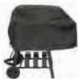
Mid-Length Grill Cover HHCVPREM

Our grill covers are constructed of a durable vinyl with sturdy velcro straps, designed to protect your grills from the elements.