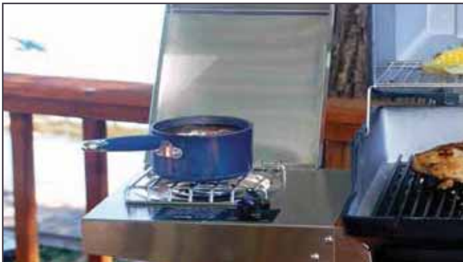
STAINLESS STEEL SIDE BURNER SBA3-N | SBA3-P

Available for all JNR, WNK & TJK model grills.