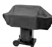
Mid-Length Grill Cover GGCVPREM