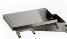
Stainless Steel Drop Down Shelf