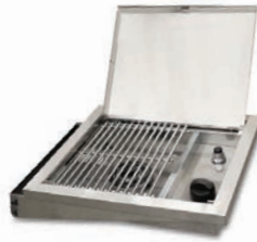
STAINLESS STEEL SIDE BURNER