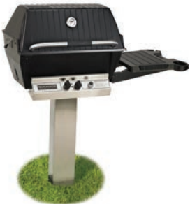
Stainless Steel In-ground Post