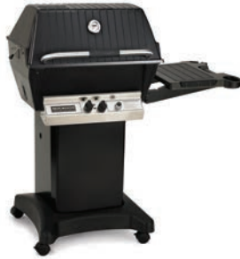
Black Painted Steel Cart