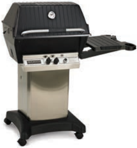
Stainless Steel Cart