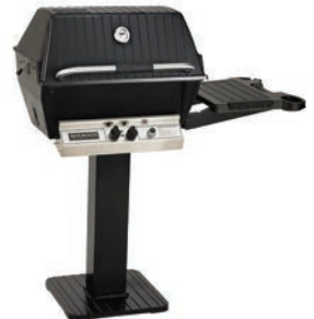
Painted Steel Patio Post with Cast Iron Base