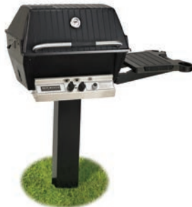
Painted Steel In-ground Post