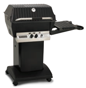
Painted Steel Cart (Packages Only)