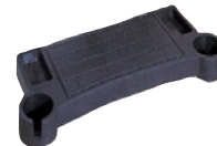
Black Composite Surface Front Shelf*