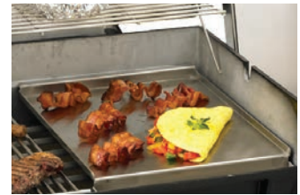
STAINLESS STEEL GRIDDLE