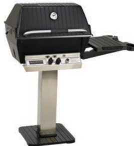
Stainless Steel Patio Post with Cast Iron Base