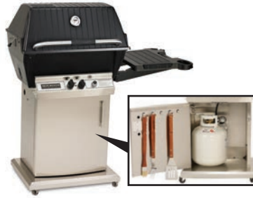
Stainless Steel Storage Cart (P3X and H3X Only)